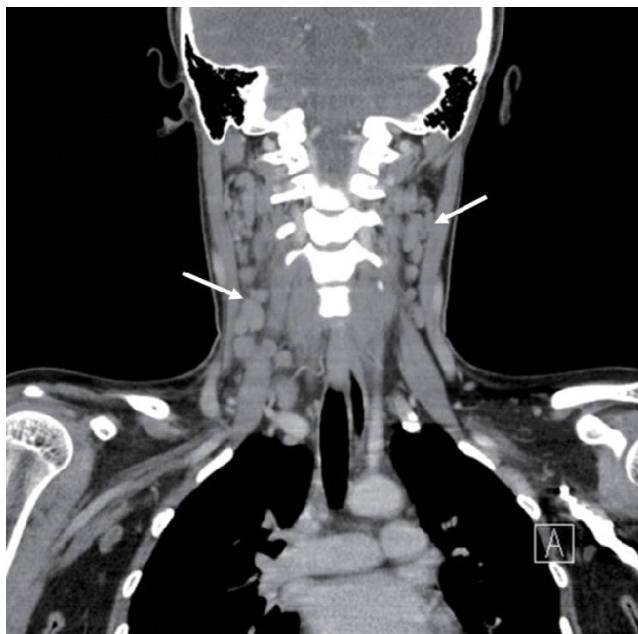
Figure 2 Computed tomography of the neck shows multiple enlarged lymph nodes on both sides of the neck.

In 2012, a female under the age of 32 was examined to have the swollen and enlarged lymph nodes on both sides of her neck with no pain and no weight loss. An excision biopsy was performed and submitted for histopathological assessment. After observing under microscopy, an extensive area of necrosis bounded by the broad zones of histiocytes and activated lymphoid cells were found. In some other areas of the nodes, expansions of Para cortical regions were seen. The small reactive lymphoid cells in the swollen lymph nodes were also present. Histopathology suggested a necrotizing lymphadenitis which was suspected as systemic lupus erythematosus (SLE). Other tests were performed such as ANA, but the results were negative. Patient was treated with symptomatic treatment for weeks with Wysolone, Pentocid 40 and Augmentin [9].