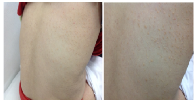
Figure 2: The skin lesion one month later.