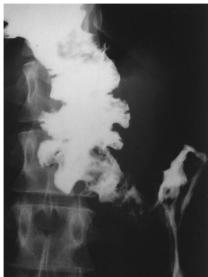
Figure 5: 36 months after initial surgery: Colon graft is straight and cologastric anastomosis is widely patent.