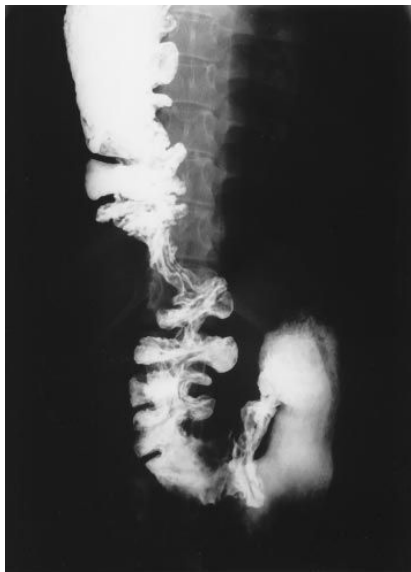
Figure 4: Intraabdominal siphon like loop of the colon graft.

and posterior side of stomach was partially structured. Approximately 15 cm of distal redundant colon was resected without causing injury to the main vascular pedicle supplying the colon graft. A new end-to-end cologastric anastomosis was performed with interrupted suture. The early postoperative outcome was uneventful and patient resumed oral intake with immediate improvement in her preoperative symptoms. The patient was discharged on day 14 with ability to eat a normal diet. A barium study performed 6 months after surgery, demonstrated a straightened colonic graft with minimal hold up ( Figure 5 ).