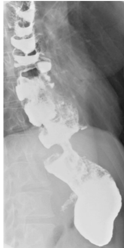
Figure 3: straight colon graft with slight barium retention.